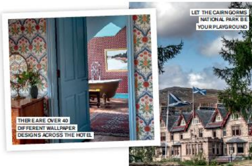
LET THE CAIRNGORMS NATIONAL PARK BE YOUR PLAYGROUND

Rooms from £250, including breakfast; thefearms.com